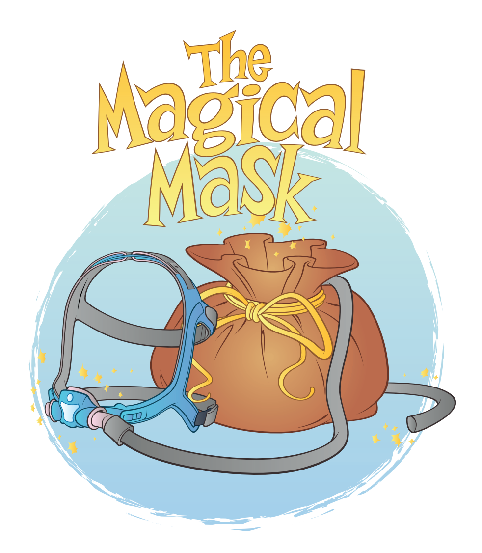
This book belongs to: